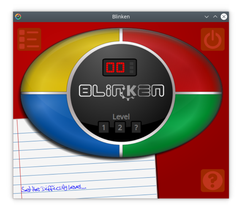
There are 3 levels in Blinken:

Once you are familiar with the workings of the application, a game can be started by pressing the Start button in the center of the screen. This 'powers on' the device, as shown by the illuminated score counter. You can then choose the difficulty level that you want to attempt: